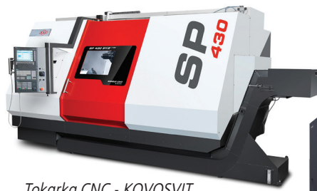
Tokarka CNC - KOVOSVIT MAS POLSKA - SP 430